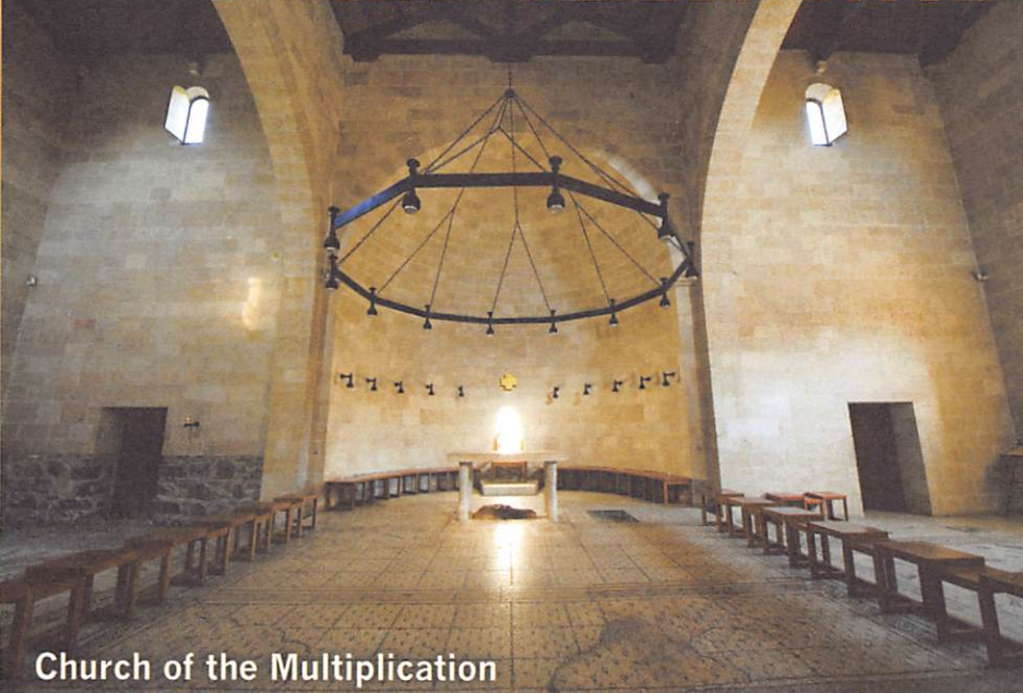
Church of the Multiplication