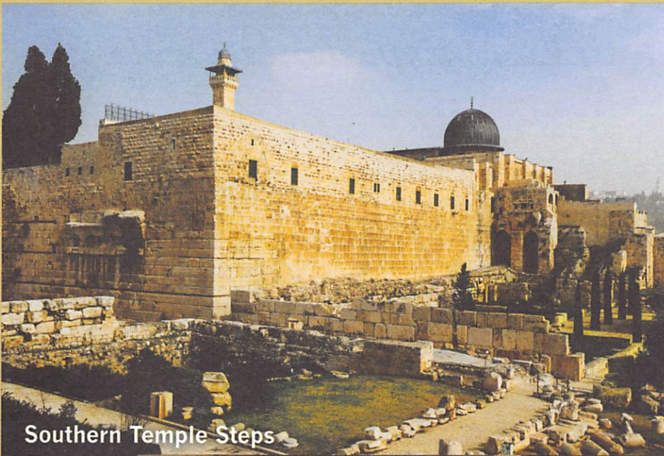
Southern Temple Steps

Scheduled International Flights • Top Quality Four Star Hotels • Israeli Buffet Breakfast & Dinner Daily • Top Guide with In-Depth Knowledge of the Old and New Testaments • Private Air Conditioned Motorcoach Visits to the Major Historical Sites • Boat Ride on the Sea of Galilee • Certificate of Your Pilgrimage to ISRAEL .....and more!