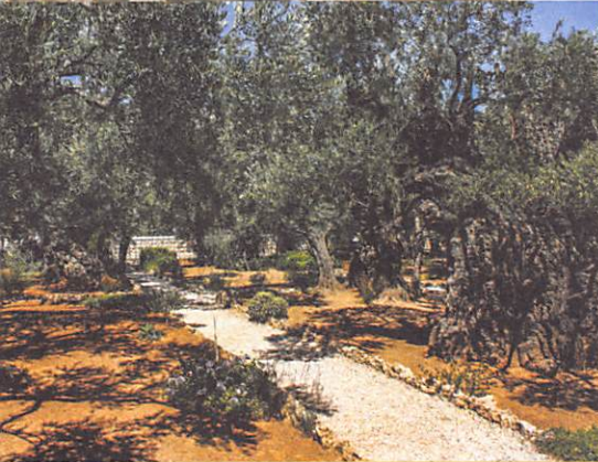
Ein Gedi Falls (top)