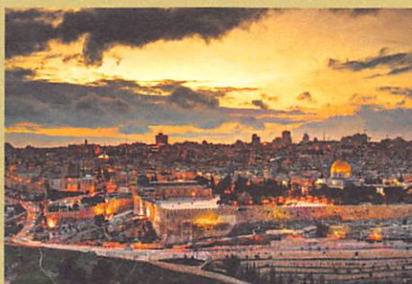
Sunset over Jerusalem