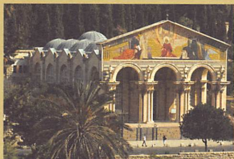
Church of all Nations

NOTE: Tour operator reserves the right to alter any part of this itinerary.